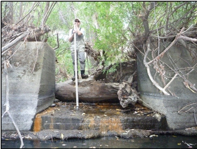
Figure 2a. Downstream view of concrete dam and sill.