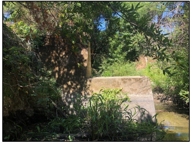
Figure 2b. Downstream view of concrete dam on left bank.