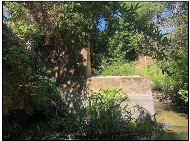
Figure 2b. Downstream view of concrete dam on left bank.