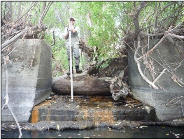
Figure 2a. Downstream view of concrete dam and sill.