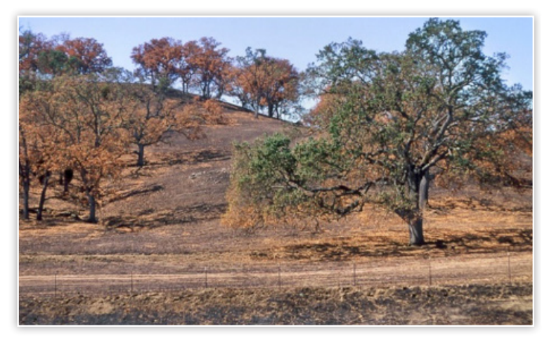
Figure 8. Burned oak woodland. Many of the trees with dead crowns survive by sprouting from their crown or base.