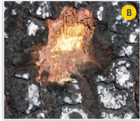
Figure 7. A) Dead cambium and B) live cambium.