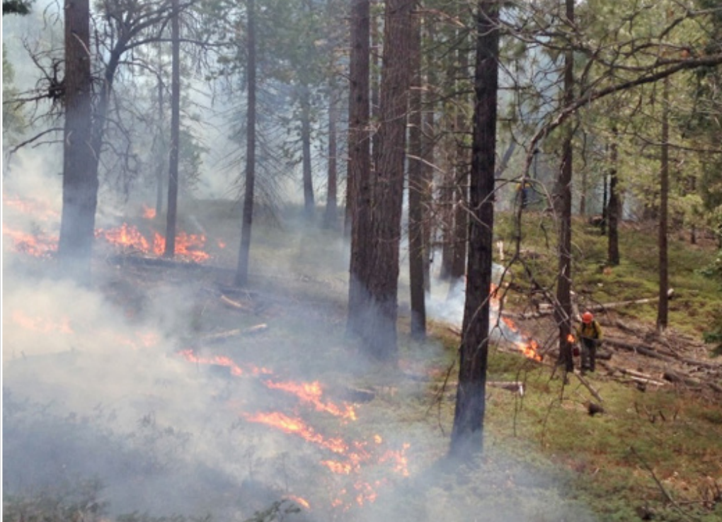
Figure 1. Low-severity prescribed fire, burning on the forest floor.

Ecological effects. Although there is considerable variation across the diverse forest types in California, mixed conifer is the most widely distributed type (and includes ponderosa pine, grey pine, sugar pine, white fir, Jeffrey pine, Douglas-fir, and black oak), and it is well adapted to frequent, low- to moderate-severity fire (table 1). Many of the dominant mature trees survive when fires burn with a mixture of low and moderate severity, which in turn can promote the growth of other plants. When some trees are killed, more light reaches the forest floor, and more soil nutrients and soil moisture are available to native species of grasses and flowering plants and to the remaining trees, which can increase their growth and vigor. Many of the species that occur in California's forests are well adapted to fire and can flourish after lower-severity fires.