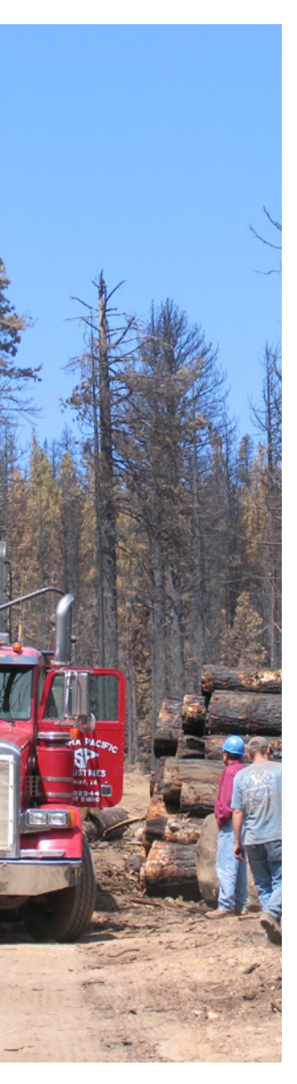
Salvage harvesting after the 2007 Angora fire.

for professionals. Whether to keep or remove a tree is a matter of opinion and depends on the values at risk in the path of potential tree fall.