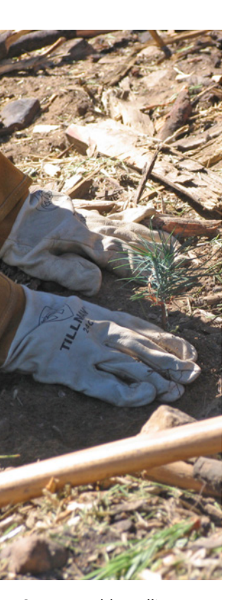
One-year-old seedling planted in a burned area with masticated material (mulch) around it.

preparation and tree planting, see Forest Stewardship Series 7 on forest regeneration (UC ANR Publication 8237).