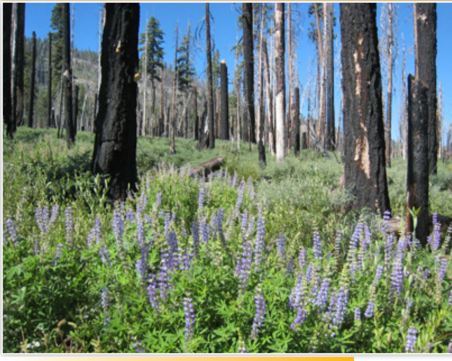
Figure 6. Postfire herbaceous plant response.

Many flowering plants and grasses have long-lived seed banks in the soil or mechanisms that enable them to sprout from their roots after fire. In some places, the postfire response of these plants can be quite vigorous, as the death of the larger trees has freed up resources for them to capture. Some plant seeds depend on fire to germinate, and some species can only grow in the conditions that occur during the first few years following a fire. In areas where the soil experienced very high burn severity, the fire may have killed