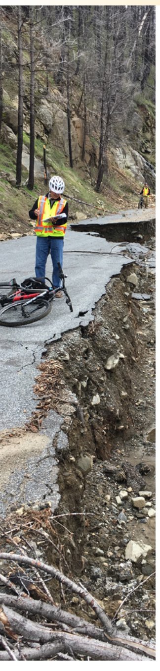
Road damage from postfire soil erosion that occurred in a severely burned area after heavy winter rains.

These erosion control treatments vary widely in terms of cost and application time. Average cost estimates for treating large landscapes, such as federally owned land, show that contour felling logs is the least expensive per acre and mulching is the most expensive. However, to date there are no comparisons for costs for smaller, private parcels. The cost differences per acre between treatments will vary by the amount of land to be treated, access routes, costs of certified, seed-free mulch, and availability of heavyequipment contractors. We recommend that landowners first consider where and how much of their property may need treatment, review the overall pros and cons of different treatments, and then obtain cost estimates for their preferred treatment approaches.