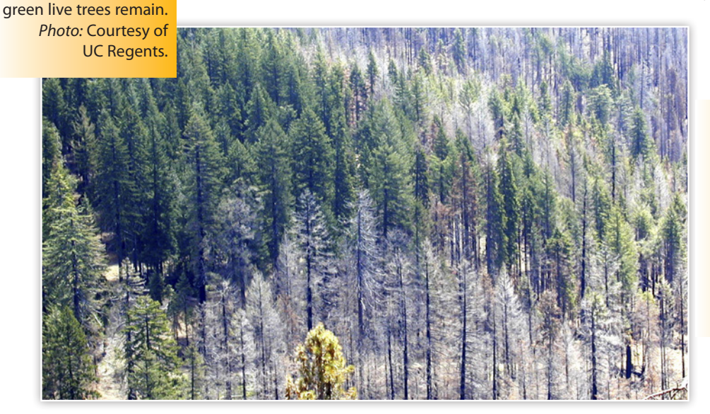
Figure 4. Smal patch of high severity burn. Note live trees that can act as seed sources in the background and regenerating trees in the foreground.

Ecological effects. Because the mixed-conifer forests of the Sierra Nevada historically burned relatively frequently at low and moderate severity, high-severity areas were spatially limited. The amount and patch size of high-severity fire that occurred prior to fire exclusion is difficult to quantify with certainty. Some research, as well as the adaptations of the dominant conifer species, suggest that highseverity patches occurred on the order of up to a few hundred acres historically (fig. 4). This created a mosaic across the landscape, where