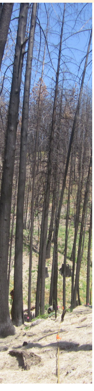
Straw mulch spread across a slope burned by the 2013 Rim fire in Stanislaus National Forest. The mulch is used to protect the soil from erosion caused by rain.

The final major determinant of erosion potential is the general pattern of rainfall in your region. The greatest erosion is produced in intense, short-duration rainstorms; it only takes one large rainfall event following a severe fire to create erosion problems. The largest erosion and runoff events occur when a major, high-intensity rainfall event occurs after a large, severe fire.