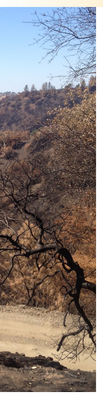
A forest road where the 2014 Sand fire burned directly above and below. The road system should be assessed after a fire to identify any increase in soil erosion potential.