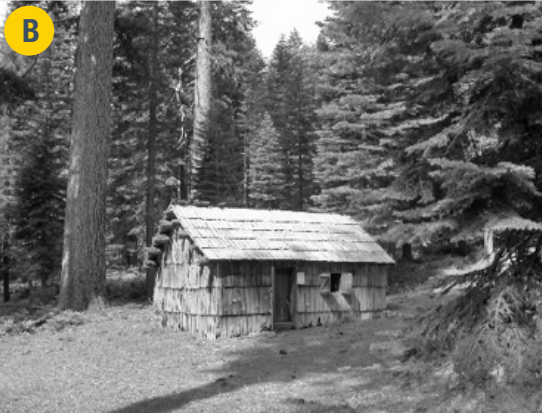
Figure 2. A) Guard station in the Plumas National Forest in 1911. B) Same location in 2005. Vegetation has filled in as a result of fire suppression.

Low-severity fire can also help promote the persistence of the dominant tree species on a site. In oak woodlands, oaks that are top-killed in a fire will generally sprout from their roots and survive. More importantly, the temporary reduction in cover by grasses and flowering plants after lowto moderate-severity fire can reduce competing grasses and allow new oak seedlings to establish. Frequent fires also kill young conifers encroaching on the site, which is important for long-term maintenance of oaks on a site.