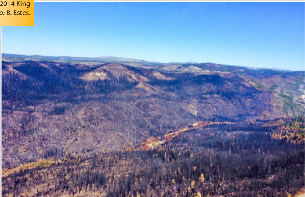
Figure 5. Large patch of high-severity burn from the 2014 King fire.

effects. These patches can lead to the large-scale loss of forested wildlife habitats, which are important to many common as well as declining wildlife species such as the Pacific fisher and the California spotted owl. They can also impact the soil so severely that seeds and nutrients stored in the soil are lost. The loss of forest litter (fresh and decayed needles, leaves, and branches on the forest floor) can increase soil erosion, which has significant effects on waterways and streams. One of the biggest concerns is that, in large patches where all trees have been killed by the fire, natural conifer forest regeneration may be delayed because of the increased distances to live tree seed sources. In addition, there is often a very vigorous native shrub response, since existing shrubs can sprout from their roots after being top-killed, and many new shrubs can germinate because the seeds in the soil are often stimulated by wildfire. These dense shrubs compete with conifer seedlings for soil and light, and so they may crowd out naturally occurring seedlings. Long-term, large patches of high severity can contribute to high fuel loads when all of the dead trees fall. When the area burns again, this can cause excessive soil heating.